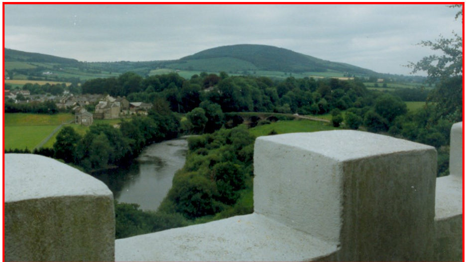
View of the village of Killavullen and the Nagle Mountains from Monanimy Castle

We would be grateful if you could have this completed and back to us by 31 October 2015.