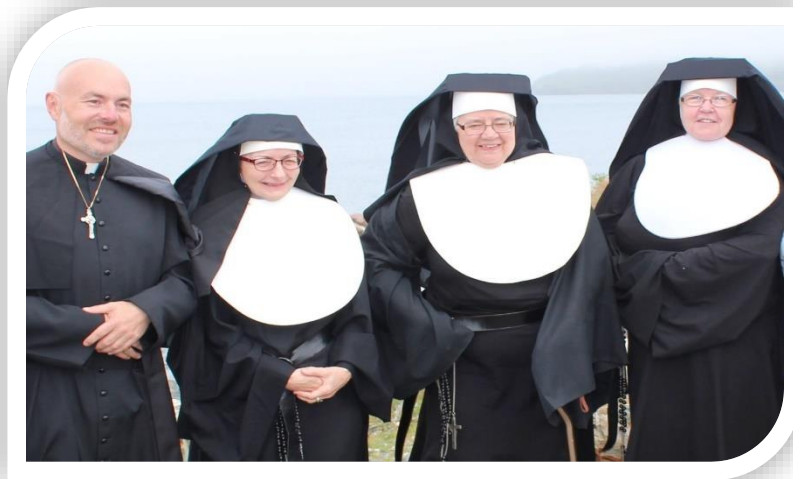
The First Sisters and the Bishop

The joyous day began with a re-enactment of the arrival of the Sisters on 11 August 1859, followed by an outdoor Eucharistic Liturgy at Battery Park on The Point, the exact spot where the Sisters came ashore 160 years ago.